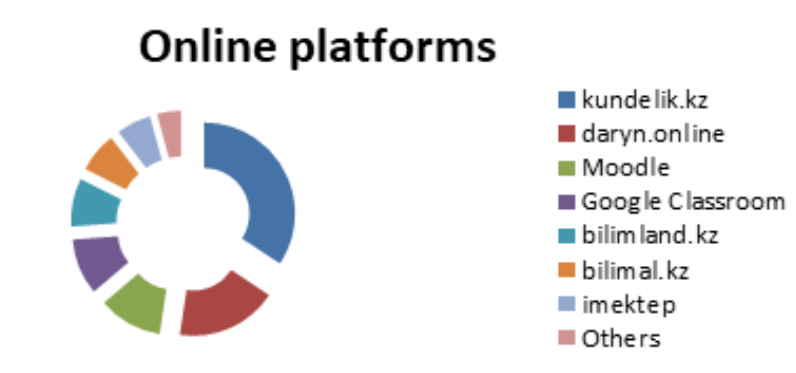
Figure 1. Online platforms used in secondary schools in Zhambyl region

Teachers report that they do not have enough time to create quality digital content for the class. In the first quarter of the 2020-2021 academic year, secondary school teachers in Kazakhstan spent more time checking student responses