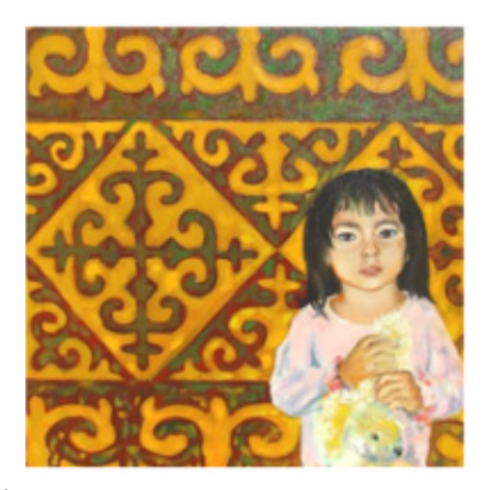
Figure 5. O. Katsyuba «Kenzhegul»

Kazakh ornament has developed many clear principles over the centuries. Plant motifs are rarely found among them, ancient motifs predominate. The specificity of the Kazakh decor is the use of clean and bright colors. These characteristics of turn-of-the-century art are also inherent in traditional Kazakh art. Their analysis allows us to link many characteristics of modern art with traditional art and identify possible aspects of tradition. An example of the design and reflection of the features of traditional folk art can be seen in the work of the Kazakh artist O. Kotsyuba «Kenzhegul» (Figure 5).