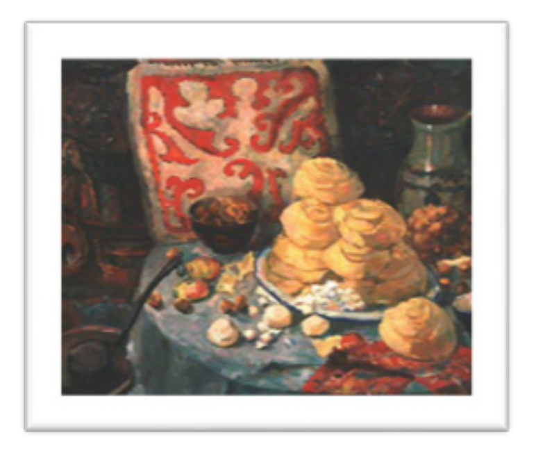
Figure 6. A. Galimbayeva «Dastarkhan»

In the works of the first professional Kazakh a reflection of the national style and originality