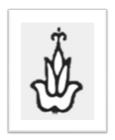
Figure 3. Gul (flower) (according to the sketches of the elements of U. Zhanibekov)

of the fruit, the renewal of eternal renewal, as well as the birth and abundance of life. In addition, all these patterns decorate household items of Kazakhs, such as wall carpets. Color – preferably red, yellow, orange and burgundy tones (Figure 3).