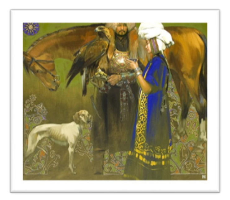
Figure 9. «Zheti qazyna»

Conclusion. Today, the process of national self-identification of Kazakh art is influenced by global trends. In addition, we can observe the observance of ancient traditional artistic expressions, such as the use of ornaments and ancient motifs. It is believed that the philosophical nature of the decor in the modern art of Kazakhstan is associated with the conditions for creating a fully conscious national cultural image.