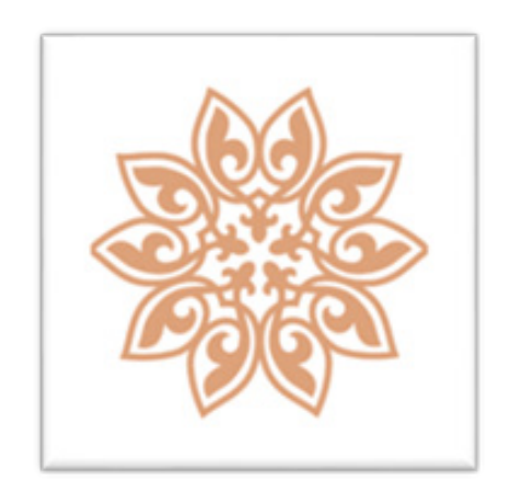
Figure 1, 2. Types of Kazakh ornament (ram's horns)

In addition to felt syrmaks and tekemets, other types of products were also ornamented, which differ and are divided into subspecies according to the technique of execution: lint – free and semi-pile woven products (alasha, baskur), chiy mats made of reed, embroidery products, many household items, costumes; elements of a dwelling-yurt, leather products, jewelry, wooden, bone, stone products and objects were ornamented.