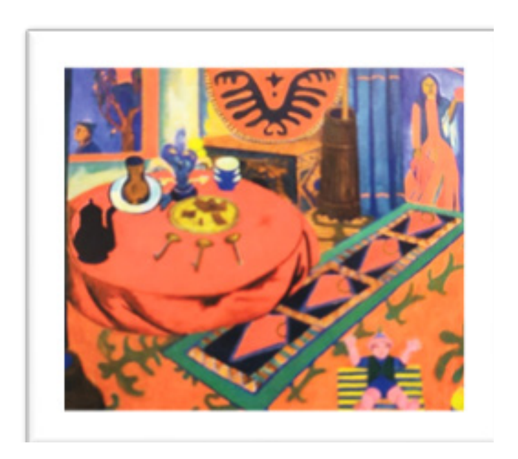
Figure 7. T. Togusbayev «Kitchen»

Among the artists of 60-s, one can single out quite an impressive size with a richness of the the work of Tokbolat Togusbayev «Kitchen», realities of national life (Figure 7).